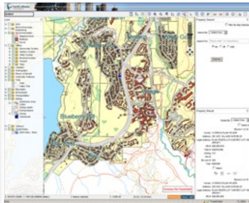
iVAULT interface with docked panels