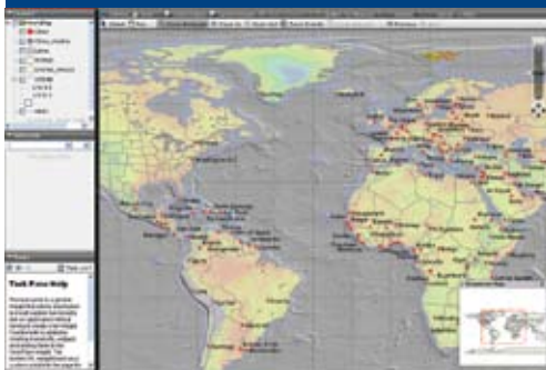
Flexible Layout Template design showing a map with capital cities, created using raster digital elevation map and vector data from SDF and Oracle.

New Flexible Web Layout Templates and application widgets accelerate the development of web mapping applications created with Autodesk MapGuide Enterprise. Since design and development tasks are separated, both nonspatial web designers and application developers can quickly build rich web mapping sites. With access to a growing number of widgets and web templates, designers can focus on site aesthetics without writing much code. And developers can freely focus on building powerful interactive AJAX (asynchronous JavaScript® and XML) applications.